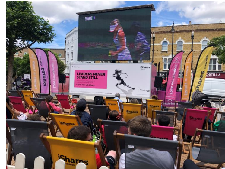
Big Screen Sponsorship