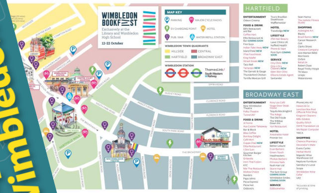
Town Centre Map