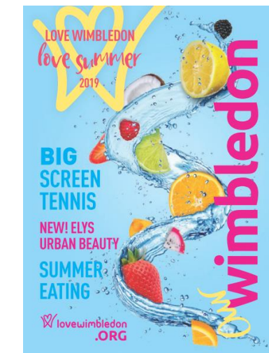
Love Wimbledon guide