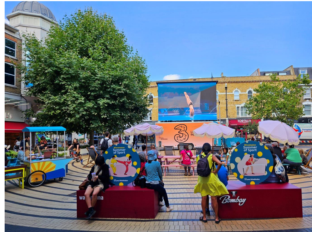
Examples of past plinth installations