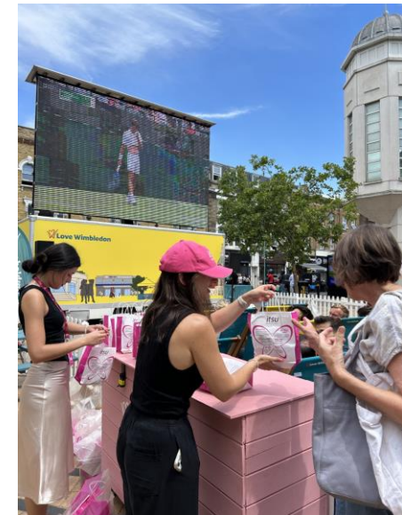
Sampling Power Hour