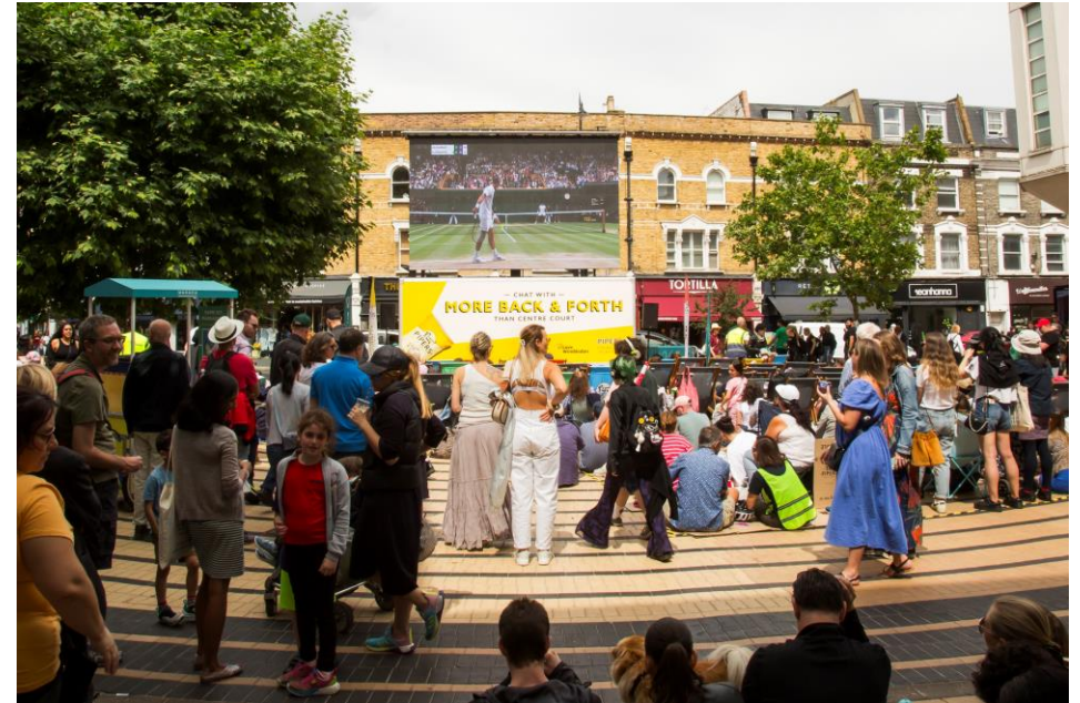
Big Screen Sponsorship